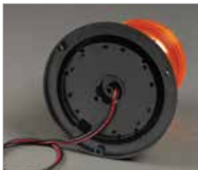
Built-in permanent/1-inch pipe mount polycarbonate base.